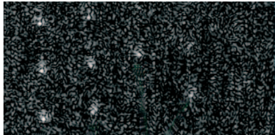
Remote detection of surface, flush and buried mines